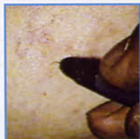
View of the vessels under normal light

The Polarised Light System provides a clear view of the sub-surface vessels. These would not be visible with a normal magnified headlight. The Polarised Light System allows faster, more accurate treatment.