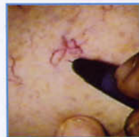
View of the vessels using the polarised light system

Did you know that 55% of women aged 20 to 70 years are affected by facial thread veins? That translates to a whopping 15 million women!