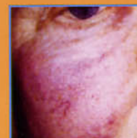
Rosacea - Before