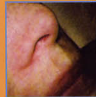
Nasal Veins - After