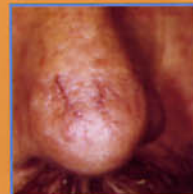
Male Nose - Before

"I am a model and had to look at this vein on the inside of my nose in the mirror every morning for the past 20 years. Now its gone! I can't believe it!" SR (London)