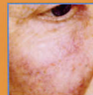
Rosacea - After

Our Society is changing where more and more men are becoming conscious of their appearance. thread veins on the nose are perfectly common amongst men and V-Beauty™ can remove these in seconds. V-Beauty™ will treat most facial red veins, including those intra-nasal veins which have previously been untreatable, and will also treat red spot and rosacea.